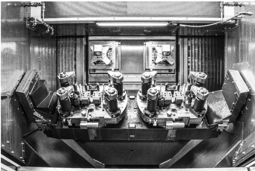
2023-06-09-Haldex-LiFLEX-II-766-i-DL-B2-Innenraum.jpg LiFLEX II 766 i DL B2 machining area with clamping fixtures for calipers