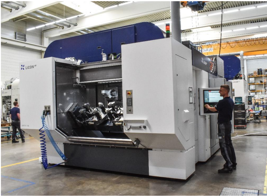
2023-06-09-Haldex-LiFLEX-II-766-i-DL-B2-Maschine+Bediener-1.jpg Twin spindle machining center LiFLEX II 766 i DL B2 with operator